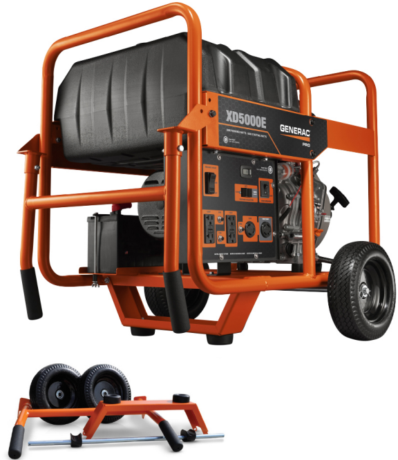
Portability Kit sold separately. Part No. G0069100

AC Rated Output Running Watts 5000 AC Maximum Output Starting Watts 5500